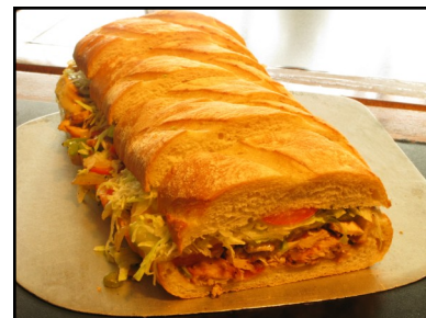
Perfect for Football Parties

Please give us at least 24 hours to prepare. 🍷