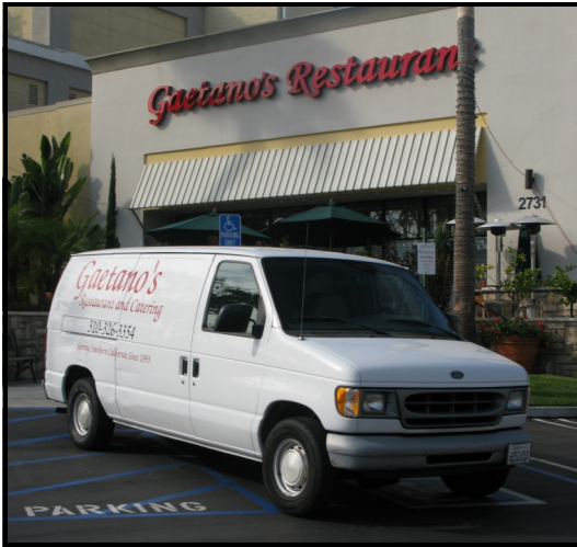
We'll deliver to your event

For only $12.95 per person, you and your group can enjoy a feast of high quality Italian food. It's delicious, convenient and is a great value. 🍷