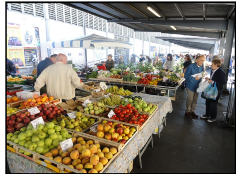
Piazza San Ambrogio, Florence

Breads and pastries are baked, purchased and eaten that day. No preservatives are added.. Anything left over is used for soup or crostini or bruschetta.