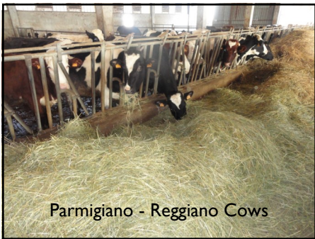
Parmigiano - Reggiano Cows

Instead of producing their fruits and vegetables in mass quantities like we do here, their produce is cultivated in small batches by men and women who have learned through generations of