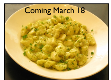
Coming March 18