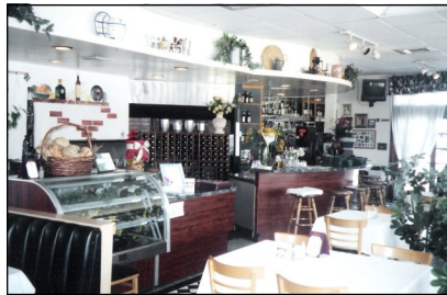
Our old location

We will also have live music that night. Reservations are recommended, so give us a call. 📞