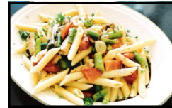
A Delicious Gift!