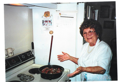
My Mom making her famous Braciolo

The winning recipe will receive a free dinner for two , and the dish will be featured on our special menu! 🍷