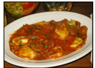
Cheese Ravioli alla Clementina