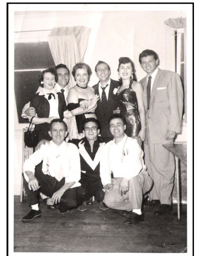
The Original Paesano’s