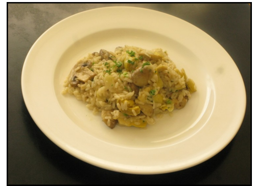
Risotto ai Carciofi Tartufo

the ground wherever they find these odors, and they willingly exchange their truffle for a dog treat and a pat on the head. Not a bad trade for the truffle hunter! 🐕